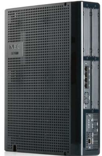
SL2100 Communications Server