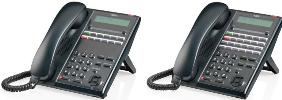
SL2100 Multi-line Terminals